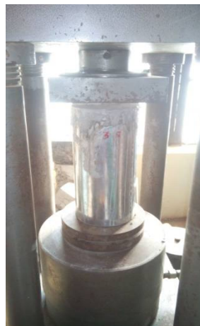
Fig 2 - CFST Cylinder under UTM Machine

The specimens are tested under UTM machine of capacity 4000 KN . The specimen is centrally placed and so that the axially load can be achieved .The load is applied and the failures are recorded .The ultimate load for nominal and various thickened cylinders are investigated .