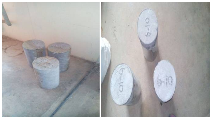
Fig 1 - Normal and CFST Casted Cylinders

The sheets of various thickness are moulded as an hollow circular cylinders of diameter 150mm and height of 300 mm . The bottom portion of the hollow cylinder is covered with plate .The M20 Concrete mix is filled into the hollow cylinder .Proper compaction is done to avoid air voids .The specimens are kept under curing for 28 days .