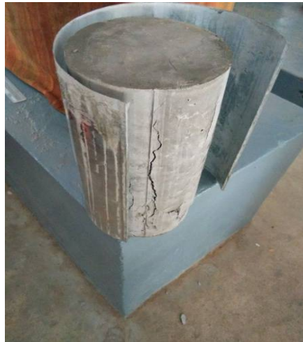
Fig 4 - At Ultimate Load