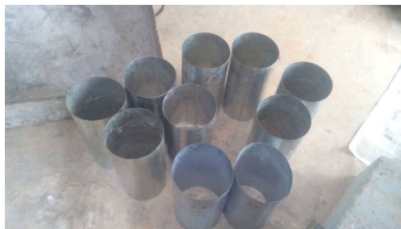
Hollow revited sheets

A galvanized iron sheet of various thickness is joined using a revited joint. The 150mm diameter and 300 mm height cylinders specimens are made with thickness 0.3mm, .35mm, .5mm