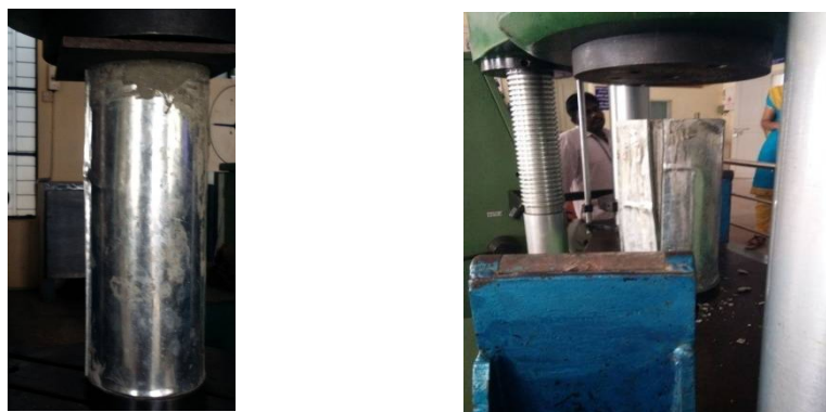
Fig 3 - Failure Mode Of CFST

The load carrying capacity for various thickened sheets are absorbed .when a load is applied the GI sheet absorb and it transfer the load to the concrete. When a concrete starts yeiding at that time the GI sheet give confinement to the concrete .on increasing the load the sheet starts buckle and at an ultimate load the busting of GI sheet occur at loud noise .Strength of 0.3 mm thickness cylinders are all most same as that of nominal cylinders.When the thickness increases the strength also increasing .0.3mm gives 22N/mm ; 0.35 mm gives 24.5N/mm ; 0.5mm gives 27N/mm .